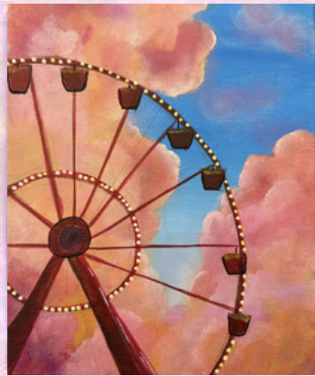
Cotton Candy Skies